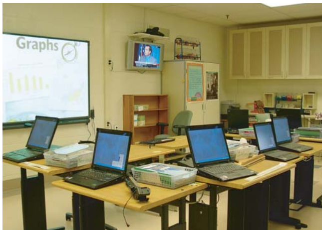
ITP converted classroom with notebook computers, height-adjustable desks, whiteboard that enables students to view their teacher’s computer screen, and a plasma screen that can be used to view television, video, or videoconference programs.

Through funding provided by the Peter J. Sharp Foundation, the Kornreich Technology Center, a program of Abilities!, was responsible for the implementation and setup of the ITP and continues in its leadership role by providing hands-on training for HVS staff, as well as continuing to develop educational content that takes advantage of this technology. ■